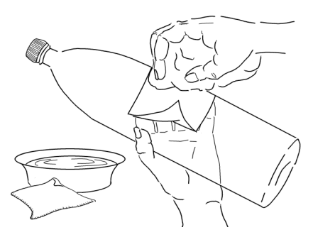
2. Paint half of each bottle black.